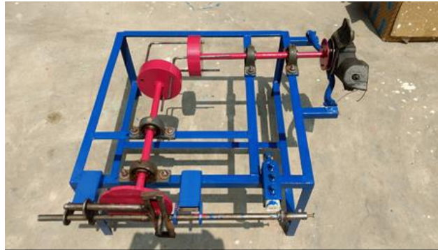
Fig. 3:, Experimental setup

It consists of links or rods that are bent exactly at 90 degree (right angle). The number of links required would be 3 to 8. The more the links, the smoother will be the operation. Links are made up of bright bars as the bright bar material has good surface finish. These links slide inside the through and through drilled Cylinders. Thus forming a sliding pair. These cylinders are coupled to the input and output shaft with help of key. Power is supplied by electric motor.